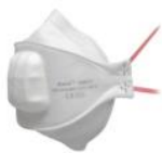
3M™ Aura™ Health Care Particulate Respirator 1883+